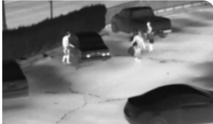
The most accurate intrusion detection and video alarm verification system available.

The TCX Bullet is the new industry leader of affordable, high-performance thermal security cameras. Whether you choose 480 or 320 resolution, the TCX Bullet will deliver 24/7 high-contrast thermal video and high-performance built-in video motion detection (VMD) with a level of affordability that the industry has never seen. Delivering extremely accurate intrusion detection and visual alarm verification in one affordable device, the TCX Bullet is a flexible thermal solution with multiple benefits. FLIR thermal cameras give you the advantage to see clearly in complete darkness without any illumination, in bright sunlight, through smoke, dust or even light fog.