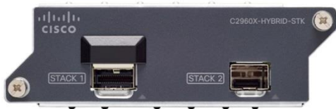
Figure 6. Cisco FlexStack-Extended: Hybrid module