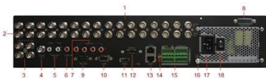
Rear Panel of DS-9116HFI-ST