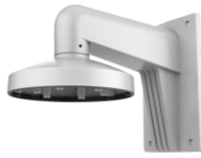
DS-1473ZJ-155-Y Wall Mount