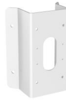
DS-1476ZJ-Y Corner Mount