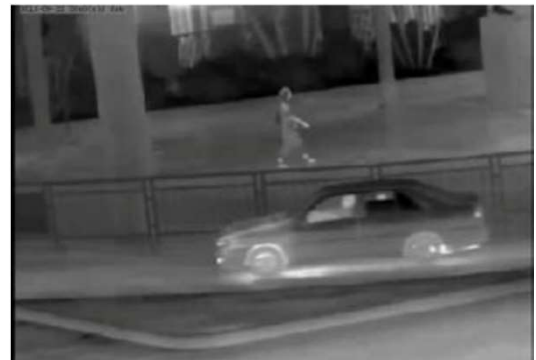
Night road monitoring