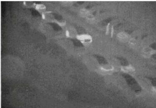
Night remote parking monitoring