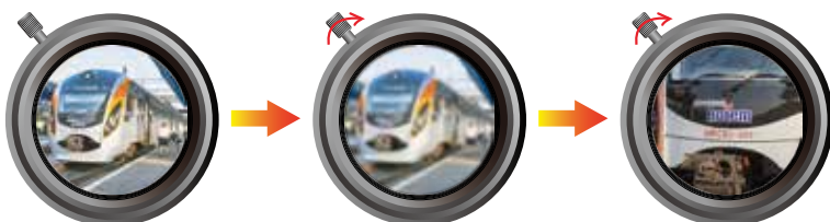
Vari-focal lens for available focal lengths

The ICA-4500V incorporates the mega-pixel vari-focal lens, which has the option of selecting a high millimeter setting for narrow viewing fields or a low millimeter setting for wider viewing fields. The ICA-4500V provides high quality images under all lighting conditions.