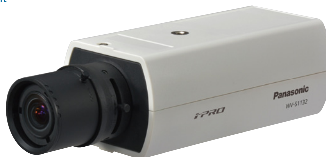
Lens : Optional