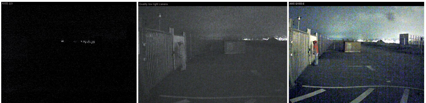
Lightfinder technology with AXIS Q1602/-E, AXIS Q1614/-E Network Cameras Left: Reference image, Middle: High-end surveillance camera, Right: AXIS Q1602/-E Network Cameras

AXIS Q16-E Network Cameras save installation time and costs since they are ready out of the box for mounting outdoors. The IP66- and NEMA 4X- rated cameras have protection against dust, rain, snow and sunlight, and can operate in temperatures as low as -40 °C (-40 °F). Furthermore, they support IK10 rating for protection against impact and vandal acts. Additionally, AXIS Q1614/-E provides shock detection with adjustable sensitivity to send an alarm to personnel during attempted vandalism. Powered by Power over Ethernet makes installation easy since there is no need for a separate power cable.