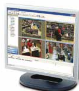
Multiple virtual camera views (up to eight views possible)