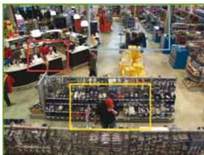
Full overview enabling cropped view areas