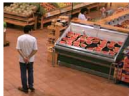
2nd Streaming Cropped area (up to VGA resolution)