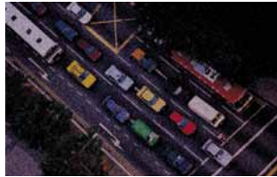
JVC Super LoLux 2™