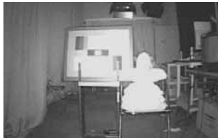
Normal strong IR LED

Equipped with an IR LED light tuned for optimal results in observing scenes at a distance of up to 5 meters, such as entranceways. This dispersion type light illuminates a wide area and exposes subjects that are at close range including people, without white-out reflection.