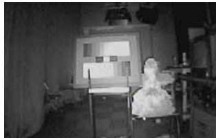
JVC Clear 5 Meter IR LED