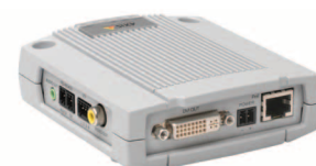
Simple monitoring solution for Axis network products.

In situations where only live video display is required – such as with a public view monitor at a store entrance, AXIS P7701 offers a more cost-effective solution than connecting a monitor to the network via a PC. AXIS P7701 can also complement a video management system by helping to offload the main server from decoding digital streams simply for display purposes.