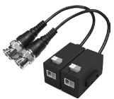
PFM800-E Passive HDCVI Balun