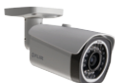
N133BD/P 2.1MP Fixed IR Bullet IP Camera