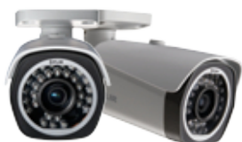
N133BD-2 2.1MP Fixed IR Bullet IP Camera 2 Pack