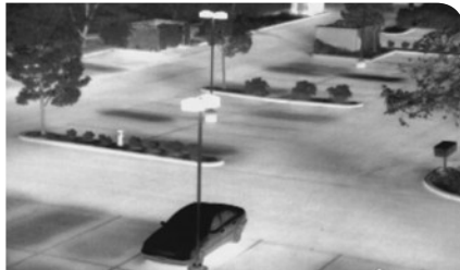
The most accurate intrusion detection and video alarm verification system available.