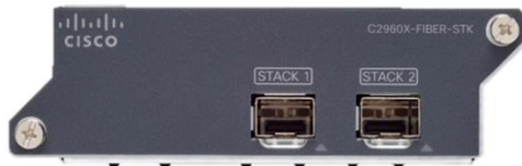
Figure 7. Cisco FlexStack-Extended: Fiber module