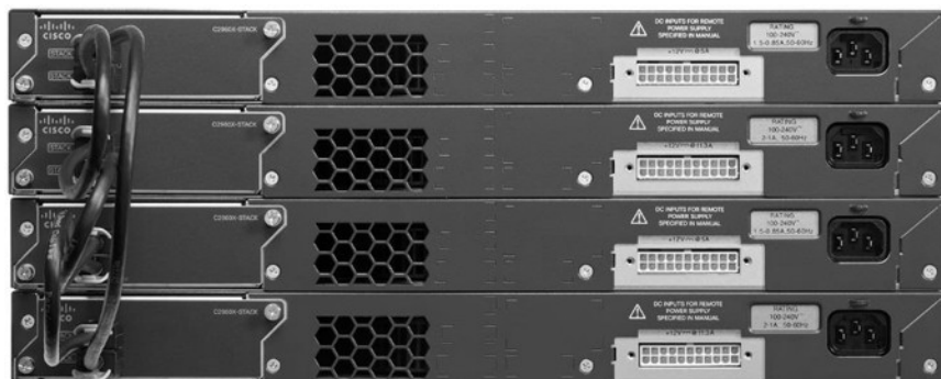
Figure 5. Cisco FlexStack-Plus switch stack