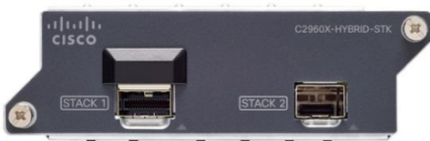
Figure 6. Cisco FlexStack-Extended: Hybrid module