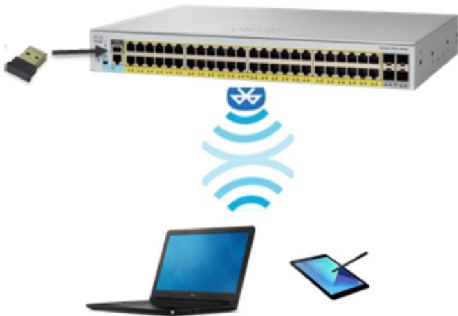
Figure 4. Over-the-air switch access using Bluetooth