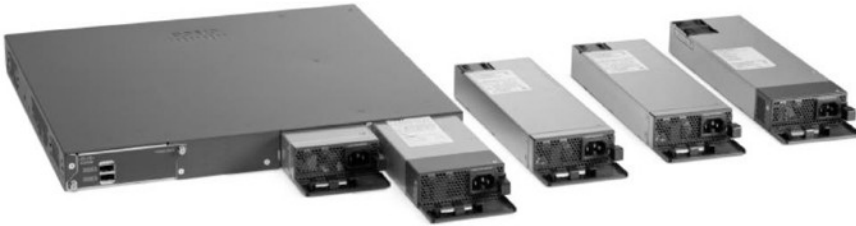
Figure 2. Cisco Catalyst 2960-XR Series power supply

Dual redundant power supplies are supported on the Cisco Catalyst 2960-XR Series Switches. These switches ship with one power supply by default. The second power supply can be purchased at the time of ordering the switch or as a spare. These power supplies have built-in fans to provide cooling (Figure 2).