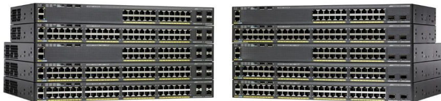
Figure 1. Cisco Catalyst 2960-X Series Switches

Cisco® Catalyst® 2960-X and 2960-XR Series Switches are fixed-configuration, stackable Gigabit Ethernet switches that provide enterprise-class access for campus and branch applications (Figure 1). They operate on Cisco IOS® Software and support simple device management as well as network management. The Cisco Catalyst 2960-X and 2960-XR Series provide easy device onboarding, configuration, monitoring, and troubleshooting. These fully managed switches can provide advanced Layer 2 and Layer 3 features as well as optional Power over Ethernet Plus (PoE+) power. Designed for operational simplicity to lower total cost of ownership, they enable scalable, secure, and energy-efficient business operations with intelligent services. The switches deliver enhanced application visibility, network reliability, and network resiliency.