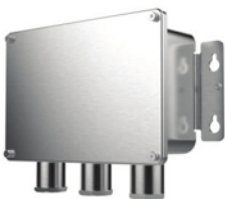
DP-1284ZJ-M Junction Box