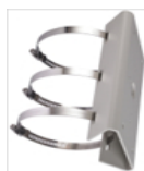
DS-1275ZJ Vertical pole mount