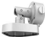
DS-1283ZJ Wall Mount (3-axis Adjustment)