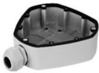
DS-1280ZJ-DM25 Junction Box