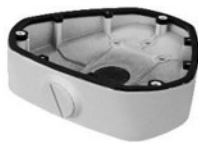
DS-1281ZJ-DM25 Inclined Ceiling Mount