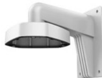
DS-1273ZJ-DM25 Wall Mount