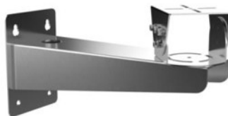
DS-1701ZJ Wall Mounting Bracket