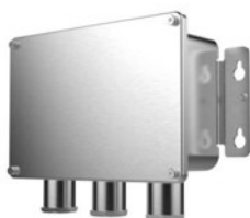
DS-1284ZJ-M Junction Box