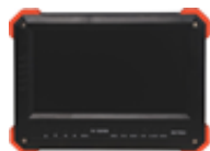
DS-TT-X41T TVI Tester