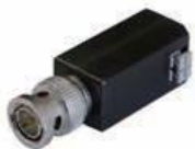
DS-1H18 Video Balun