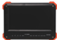
DS-TT-X41T TVI Tester