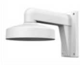
DS-1272ZJ-110 Wall Mounting