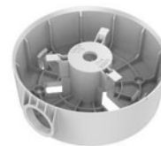
DS-1280ZJ-PT3 Junction box