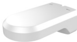
DS-1294ZJ Wall Mount