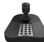
DS-1005KI USB Joy-stick