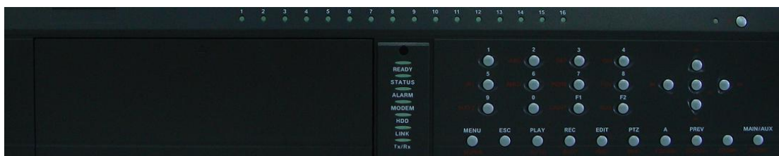
DS-8000HTI-S Front Panel

DS-8000HTI-S series combines the advantages of Digital Video Recorder (DVR) and Digital Video Server (DVS). It is widely applied as a stand-alone unit or a part of a powerful surveillance system.