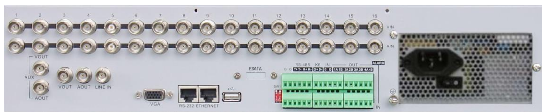
DS-8016HCI-S Rear Panel