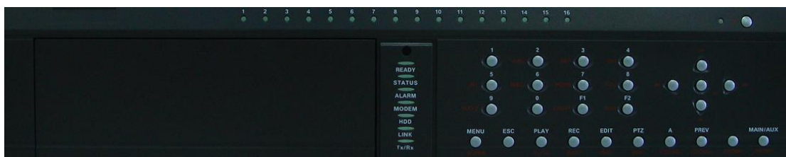
DS-8000HTI-S Front Panel

DS-8000HTI-S series combines the advantages of Digital Video Recorder (DVR) and Digital Video Server (DVS). It is widely applied as a stand-alone unit or a part of a powerful surveillance system.