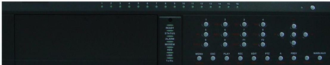
DS-8000HFI-S Front Panel

DS-8000HFI-S series combines the advantages of Digital Video Recorder (DVR) and Digital Video Server (DVS). It is widely applied as a stand-alone unit or a part of a powerful surveillance system.