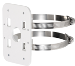
PFA152 Pole mount