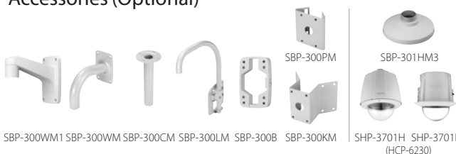
SBP-300WM1 SBP-300WM SBP-300CM SBP-300LM SBP-300B SBP-300KM SHP-3701H SHP-3701F (HCP-6230)