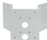
Corner Mount (BC002)