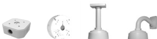
SN-CBK629A SN-CBK633 SN-CBK623 SN-CBK624