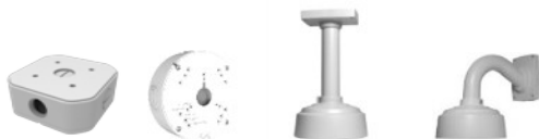
SN-CBK629A SN-CBK633 SN-CBK623 SN-CBK624