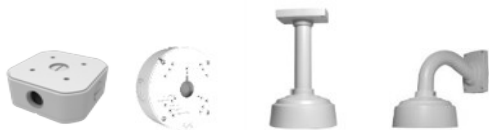
SN-CBK629A SN-CBK633 SN-CBK623 SN-CBK624