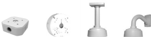
SN-CBK629A SN-CBK633 SN-CBK623 SN-CBK624