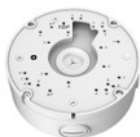
SN-CBK645A Junction Box