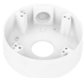
SN-BK326B Junction Box