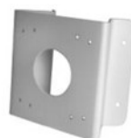
SN-CBK626 Corner Mount