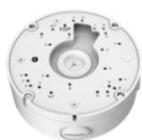
SN-CBK645A Junction Box