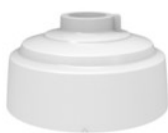
SN-CBK625 Pendant Cap