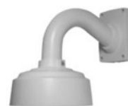
SN-CBK624 Wall Mount