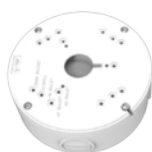
SN-CBK633 Junction Box