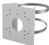
SN-CBK627B Pole Mount