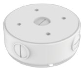
SN-CBK633B Junction Box