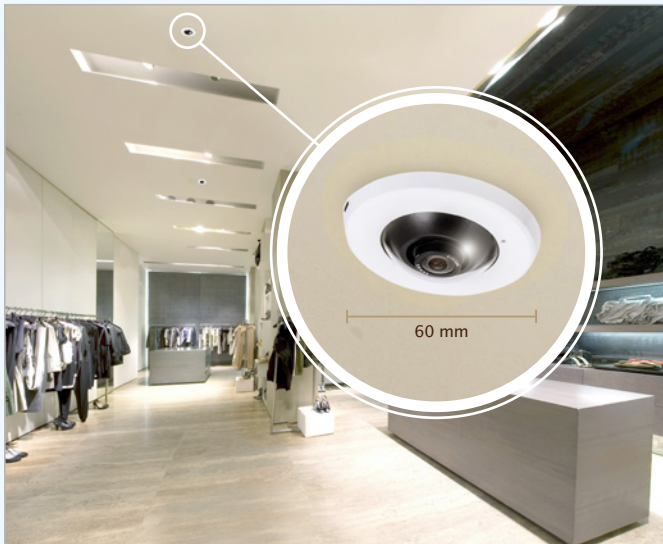
The Stylish Recessed-Mount Fisheye Network Camera