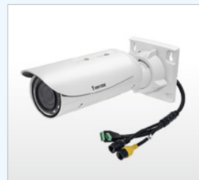
Embedded PoE Extender