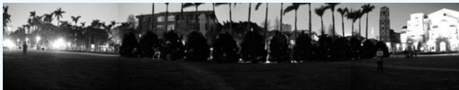
Night View (IR Off)