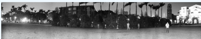
Night View (IR On)