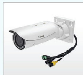
Embedded PoE Extender