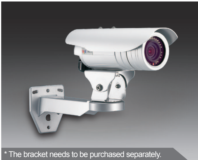
* The bracket needs to be purchased separately.

H.264 Megapixel Outdoor IP IR D/N PoE Bullet Camera