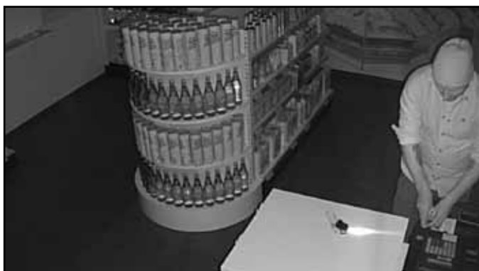
As light diminishes below a certain level, the cameras can automatically switch to night mode to deliver quality images in dark environments.

AXIS M11-L Series provides day and night varifocal boardmount lens and adjustable IR LED illumination for optimal light in selected viewing angles. With the highly efficient and discreet integration of IR LEDs, the cameras provide automatic illumination of a scene in complete darkness, at an event or when requested by a user. The IR LED illumination which is invisible to the human eye, is perfect for discovering objects in a range of up to 15 meters (50ft.)