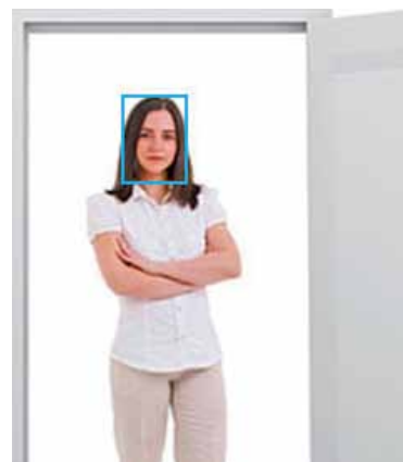
Unique pixel counter feature

The pixel counter offered in AXIS M11-L cameras allows the installer to easily verify that the camera installation fulfills any regulatory or specific customer requirements, for example, calculating the pixel resolution of the face of a person passing a doorway monitored by the camera.