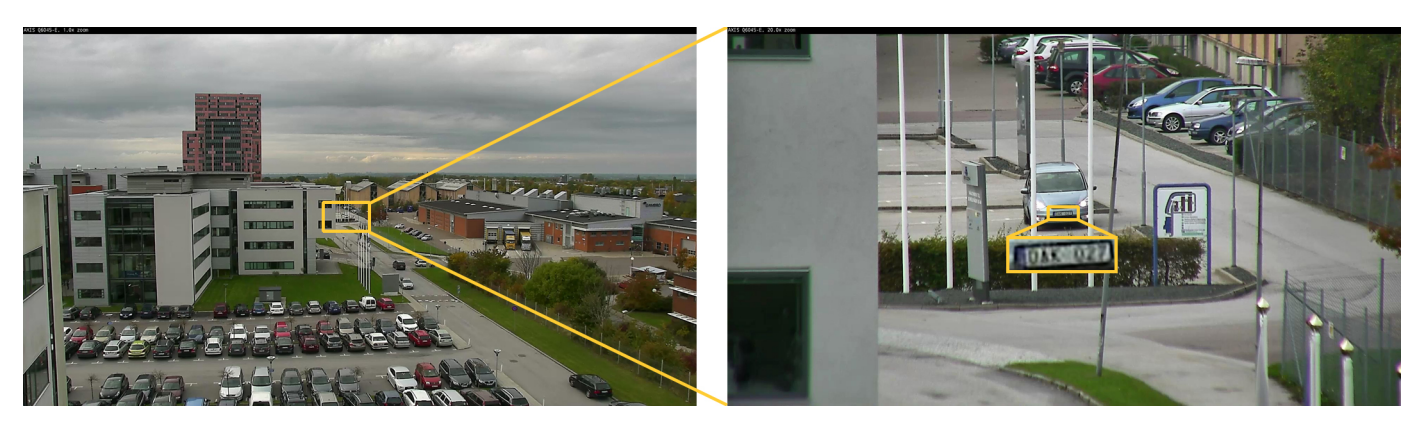
Snapshots of HDTV 1080p views from AXIS Q6045-E: at left, wide view; at right, 20x zoomed-in view where the license plate of a car 275 m (900 ft.) away can be read.