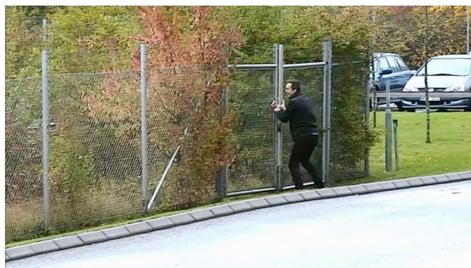
Under vibrating conditions: at left, image without EIS; at right, a snapshot from a vibrating AXIS Q6044-E with EIS activated.