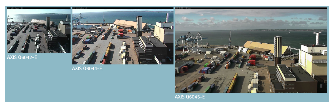
The images above show the field of view and level of detail provided by the three AXIS Q60-E PTZ domes.

The robust AXIS Q60-E PTZ domes are designed for round-the-clock pan/tilt/zoom operation in outdoor environments. The cameras can be automatically directed to 256 preset positions using guard tour. With endless 360° pan, they enable surveillance of an extremely wide area. High zoom, in combination with high resolution, enables detailed surveillance at great distances. AXIS Q60-E cameras have fast and precise pan/tilt performance. They can also tilt 20° above the horizon, which makes it possible for the cameras to see higher than their mounting position. This can be useful, for example, at a stadium where there is a need to look up at the stands.