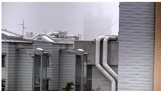
Images from AXIS Q6044-E: at left, without automatic defog; at right, with automatic defog activated.