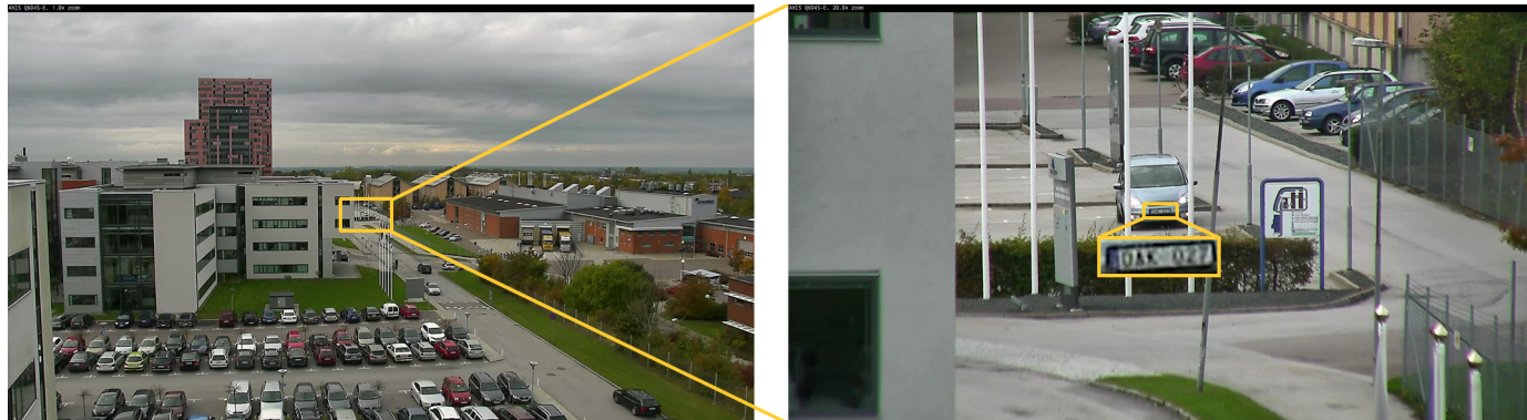
Snapshots of HDTV 1080p views from AXIS Q6045-E: at left, wide view; at right, 20x zoomed-in view where the license plate of a car 275 m (900 ft.) away can be read.