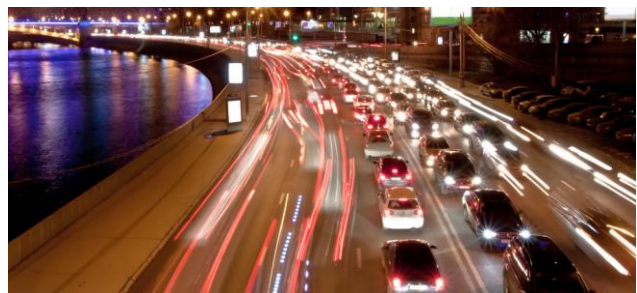
HIGH FRAME RATE & EXTREME LOW LUX