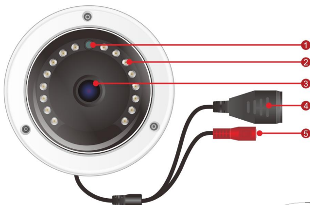
Photo Indication & Dimension Diagram