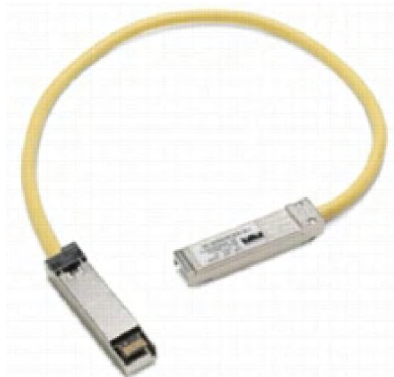
Figure 2. Cisco Catalyst 3560 SFP Interconnect Cable

The Cisco Catalyst 3560 SFP Interconnect Cable (see Figure 2) provides for a low-cost point-to-point Gigabit Ethernet connection between Cisco Catalyst 3560 v2 switches. The 50cm cable is an alternative to using SFP transceivers when interconnecting Cisco Catalyst 3560 v2 switches through their SFP ports over a short distance.