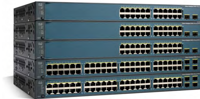
Figure 1. Cisco Catalyst 3560 v2 Switches

The Cisco® Catalyst® 3560 v2 Series (Figure 1) is the next-generation energy-efficient Layer 3 fast Ethernet switches. This new series of switches supports Cisco EnergyWise technology, which enables companies to measure and manage power consumption of network infrastructure and network-attached devices, thereby reducing their energy costs and their carbon footprint. The Cisco Catalyst 3560 v2 Series consumes less power than its predecessors and is the ideal access layer switch for enterprise, retail, and branch-office environments, as it maximizes productivity and investment protection by enabling a unified network for data, voice, and video.