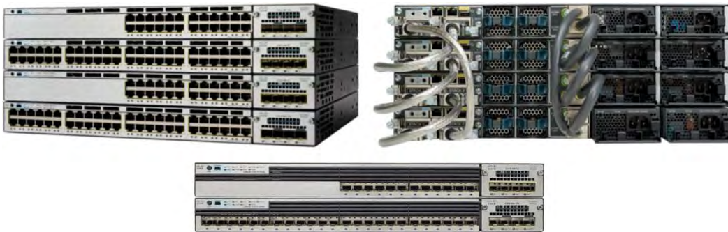
Figure 1. Cisco Catalyst 3750-X Series Switches (Front and Back)

Table 1 shows the Cisco Catalyst 3750-X Series configurations.