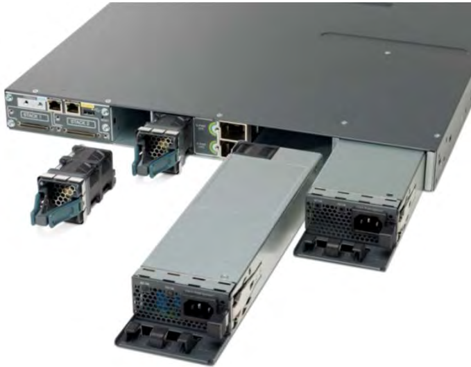
Figure 5. Dual Redundant Power Supplies

Table 6 shows the different power supplies available in these switches and available PoE power.