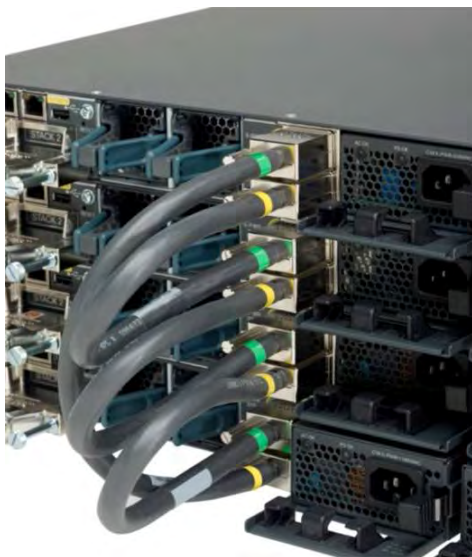
Figure 3. StackPower Connector

The Cisco Catalyst 3750-X Series introduces Cisco StackPower technology, innovative power interconnect system that allows the power supplies in a stack to be shared as a common resource among all the switches. Cisco StackPower unifies the individual power supplies installed in the switches and creates a pool of power, directing that power where it is needed. This feature is available in all Cisco Catalyst 3750-X Series Switches feature sets. Up to four switches can be configured in a StackPower stack with the special connector at the back of the switch using the StackPower cable**, which is different than the StackWise cables. (See Figure 3.)