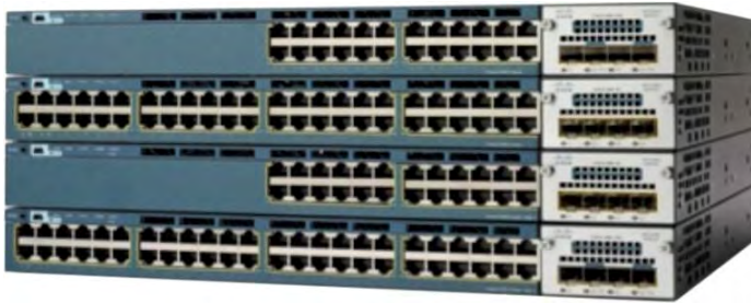
Figure 2. Cisco Catalyst 3560-X Series Switches

Table 2 shows the Cisco Catalyst 3560-X Series configurations.